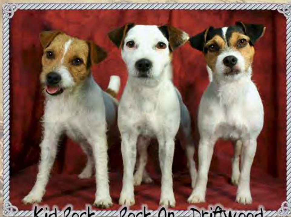
Kid Rock Rock On Driftwood

Good Luck Texas Two Step Exhibitors from the Sea Dog "Crew"